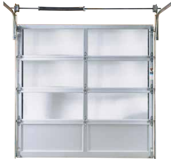
AlumaView AV200 with aluminum bottom panels.

AlumaView doors help you reduce energy costs with a U-shaped, vinyl bottom weatherseal secured by a sturdy aluminum retainer.