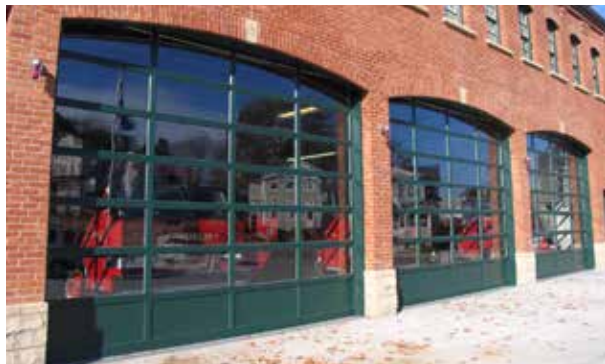
AlumaView AV200, ArmorBrite™ green with aluminum bottom panels.

Choose from six custom anodize finishes including champaign, light bronze, medium bronze, dark bronze, extra dark bronze, or black.